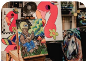
Zen Lens Photomedia