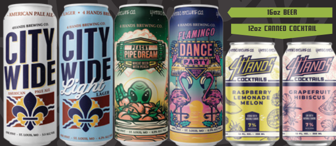
AMERICAN PALE ALE